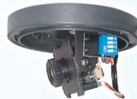
MS-C B x41E