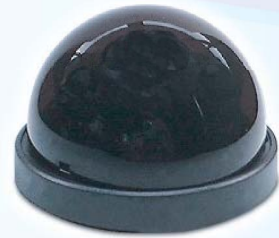
MS-C B x41