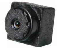
▲ 3D LENS