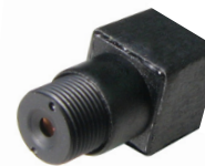
▲ 4F LENS