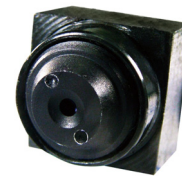
▲ 3T LENS