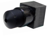
▲ 4C LENS