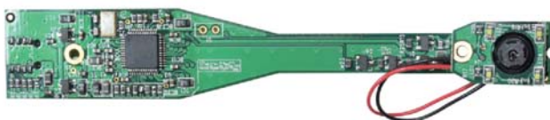
3.4mm / F 5.7 (M6)