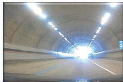
WDR Light Environment (Tunnel)