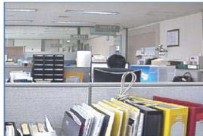
WDR Light Environment (office)