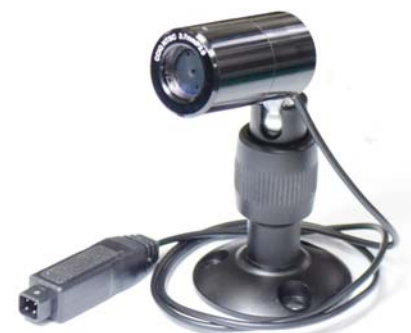
Image overlay graphics & line & text. (MISUMI create a camera by customer requirements and custom design to meet specific needs. )