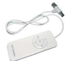
Model: UTC-100 - sold separate

User can adjust camera's Shutter, AGC, Sensitivity, Exposure, BLC, White Balance, Brightness, Contrast, Color Gain, Sharpness, Noise Reduce, OSD color, Mirror, Language via UTC controller.