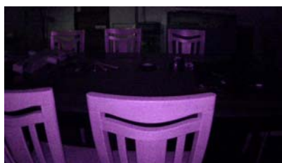
Low light camera with IR 940nm LED