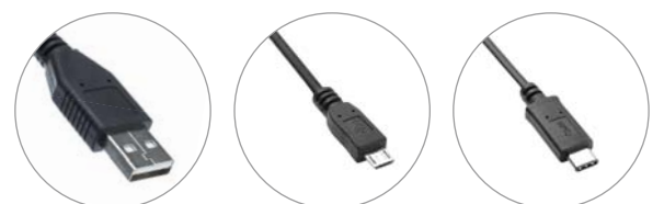
USB A type Model: TD-N104xx Micro USB OTG B type Model: TM-N104xx Type C Model: TT-N104xx